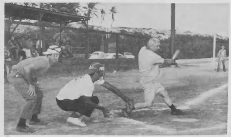
HDS versus TOA in action! HDS contra TOA den accion!